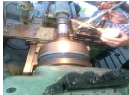
Figure 1: Photographic view of the Experimental Setup