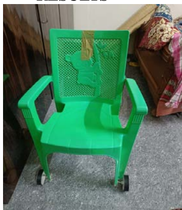
Fig 1: Front view of the wheelchair