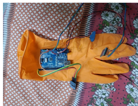
Fig 5: Transmitter for the wheelchair