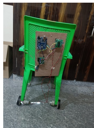
Fig 3: DC motors starts when the H-Bridge gives the power supply