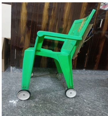
Fig 2: Side view of the wheelchair