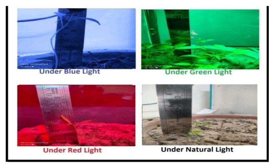
Fig 1: Growth of Chili Plant under various lighting conditions a) at the end of week 1 b) at the end of week 2 c) at the end of week 3 d) at the end of week 4.

The given figures represent the growth of chilli plant (Capsicum annum L.) when they are kept under red, blue, green and natural Sun lighting conditions at the end of week 1, week 2, week 3, and week 4 respectively shown in Fig 1. These plants were kept under different lighting conditions in a closed enclosure and were given water and adequate lighting for about 12 hours daily. The figures suggest the trends observed in the growth of the plant under different colored LEDs light. As can be seen from figures, one can easily observe that the plant grew a lot faster under the artificial color lights when compared to natural indoor lighting conditions. This suggests the theory of predominant growth of plants under certain lighting conditions. Furthermore, we can also observe that among the colored LEDs the plant grew at its fastest under blue colored light as compared to green and red colored lighting conditions. In contrast, the plant grown more steadily under the red lighting than it did under the other type. The