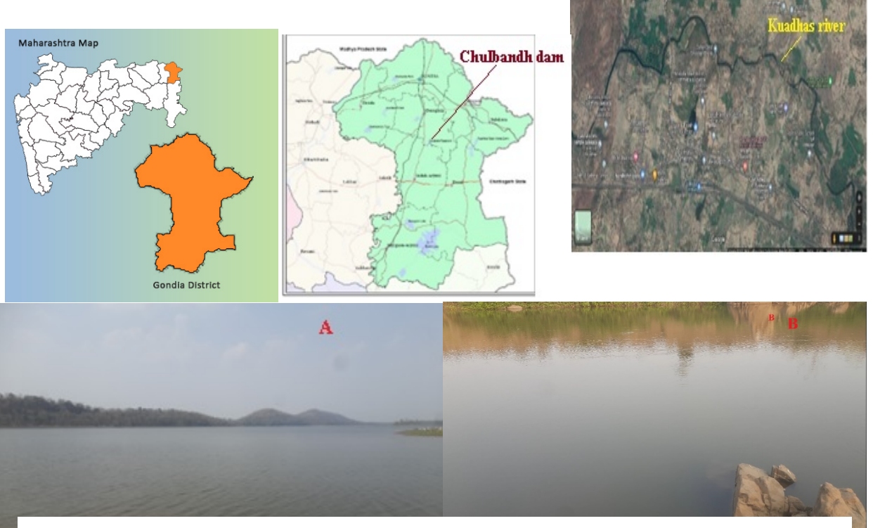
Figure 1: Location of study area (A) Chulbandh dam (B) Kuadhas river of Gondia district Maharashtra India.

The dam's attractive feature is the rain-fed water within the verdant hills' catchment. It is located 21.2288407<sup>0</sup> N and 80.2235413<sup>0</sup> E. A subtributary of Bagh, the Kuadhas river rises in the Darekasa mountains and runs through the district.