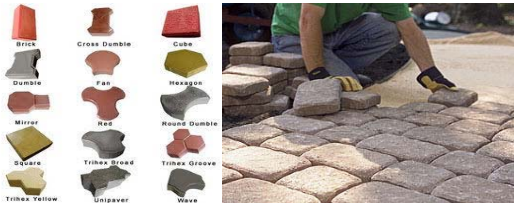
Different types & shades of concrete paver blocks