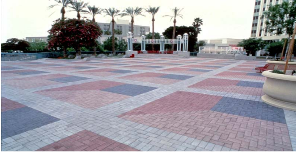
Typical Arrangement used for Drive Way