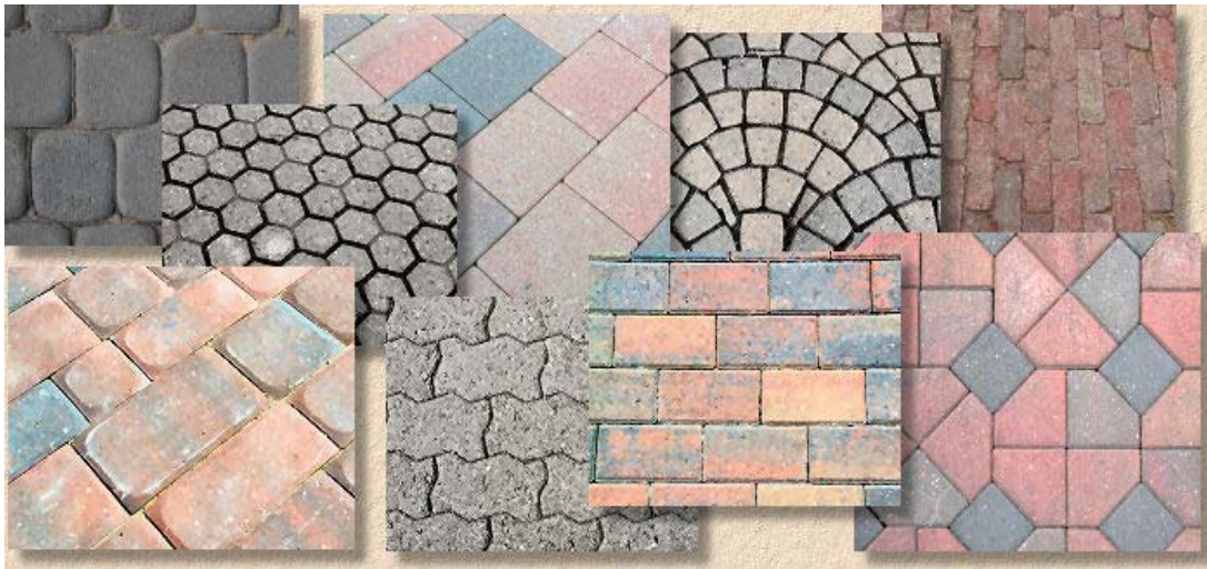
Concrete Paver Blocks Laying patterns