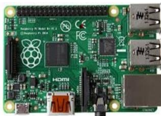
Fig.2.Raspberry Pi Board.