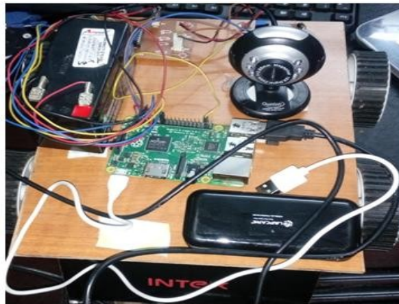
Fig.5. Hardware Assembly

–Maintained independently of the Foundation; based on ARM hard-float (armhf)-Debian 7 'Wheezy' architecture port, that was designed for a newer ARMv7 processor (or one with Jazelle RCT/ThumbEE, VFPv3 and NEON SIMD extensions built-in) whose binaries would not work on the Raspberry Pi, but Raspbian is compiled for the ARMv6 instruction set of the Raspberry Pi making it work but run more slowly. It provides some available deb software packages, pre-compiled software bundles. A minimum size of 2 GB SD card is required, but a 4 GB SD card or above is recommended. There is a Pi Store for exchanging programs. The Raspbian Server Edition is a stripped version with other software packages bundled as compared to the usual desktop computer oriented Raspbian.