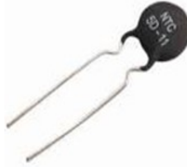
Fig.4 Fire sensor.

A flame detector is a sensor designed to detect and respond to the presence of a flame or fire. Responses to a detected flame depend on the installation. The prime function of a fire detector is to detect one or more changes in the protected environment indicative of the development of a fire condition as shown in Fig.4. Usually mounted on ceiling or in air ducts, detectors are activated in the main by smoke or radiation. Fire detectors are identified by their operating principle. The output from the fire sensor is given to an ordinary transistor. Since the microprocessor cannot detect the output coming from the fire sensor, it is given to the base of the transistor. Thus, the collector of the transistor will be given to one of the port pins of the microprocessor. Thus, when the fire occurs, the fire sensor detects the fire and its output alters. Since this output is fed to the base of the transistor, the voltage at the collector of the transistor changes as per the input applied at its base. Thus, this change occurs at the port pin of the microcontroller and therefore, the controller identifies this change and immediately performs the specified task.