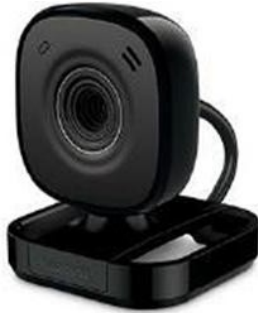
Fig.3. USB Camera.

.For this purpose we use a MJPG streamer. The below fig.3 shows the camera that has been used for monitoring of a room.