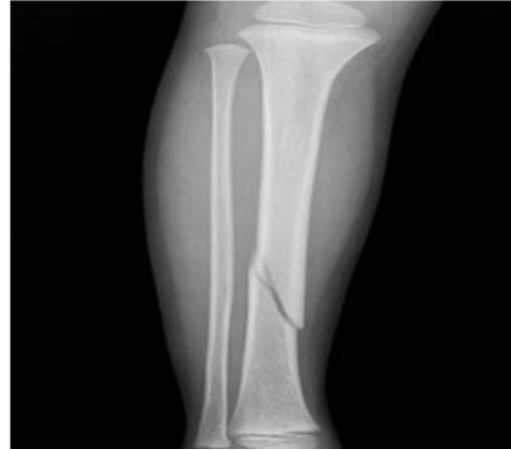
Fig 3: Input Image.