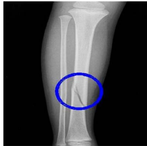
Fig 4: Output Image