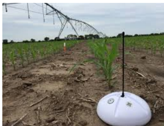
Figure 2: Precision agriculture

Unmanned irrigation refers to automatic generation of crops without the intervention of mankind. By this way, the field can think themselves according to the condition then corresponding water and pesticide sprinkling is performed. In order to this we can able to maintain the quality of the crops without spraying the pesticide throughout the field, because pesticide affects the healthiness of crops and reduces the vitamins in it. For developing an efficient system for agricultural system management, the foremost inputs to the system will be the availability of accurate data's (figure 2) like soil properties, agronomic, physicochemical parameters, atmospheric data, etc., Data collection can be made flexible on a day-to-day basis or even hourly basis based on the need. Normal laboratory analysis of above mentioned parameters and manual decision-making take a long time even with the most sophisticated analytical techniques. Most of the samples have to be brought from the field to laboratories to analyze most of the time. By the time the results are available and decisions are taken, the conditions of the farm may change which results in inappropriate decision. Quick and quality decision-making at the farm level will enhance agricultural productivity and quality manifold which further needs accurate and real time properties of the field.