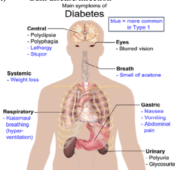
Figure 2: Symptoms of Diabetes