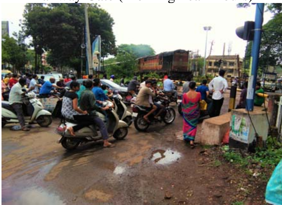
Fig: The traffic congestion due to closing of the Railway Gate (Evening Peak Hours)