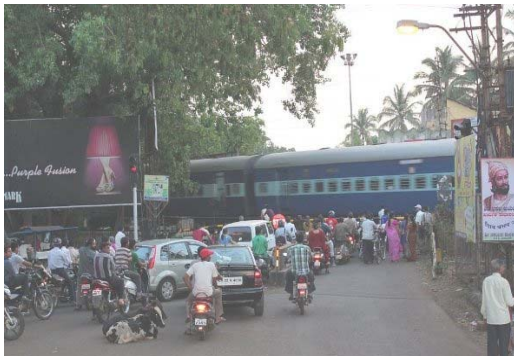
Fig: The traffic congestion due to closing of the Railway Gate (Morning Peak Hours)