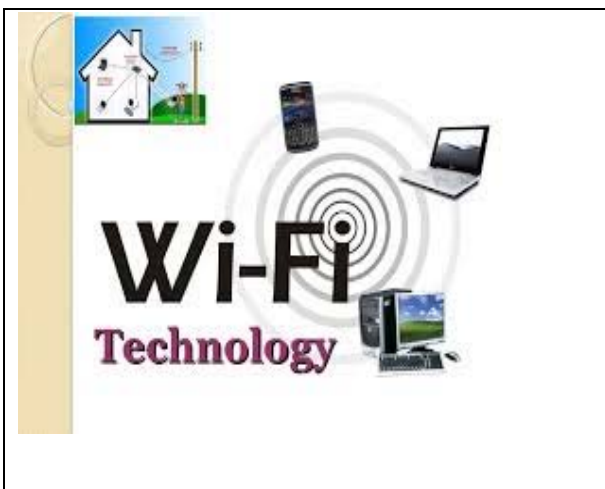
Figure4- Wi-Fi Technology