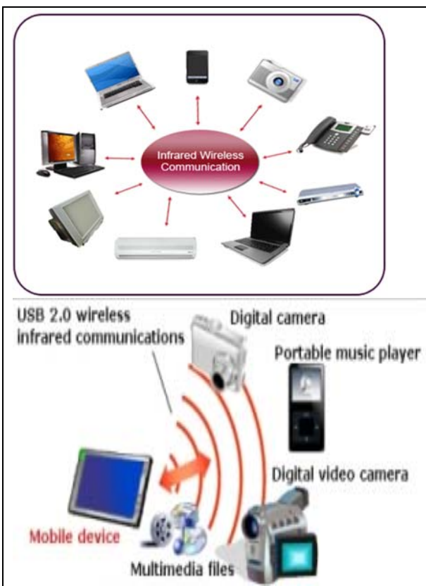
Figure6-IR wireless technology

when the source and destination are not directly visible to each other. The application of IR wireless technology is mostly in home automation; home devices control units, robot controlling systems, medium-range communication, mobile phones, laser communications, headsets, modems, and printers and other peripheral devices. In IR wireless technology rays cannot pass through walls that is it is blocked by walls. So that in IR communications, communication is usually not possible between various rooms of a home or between different houses near to each other unless they have facing windows, this is disadvantage of IR wireless technology. But IR wireless operates more efficiently within the range of 20-25 Ft. in the environment without WLAN equipment's.