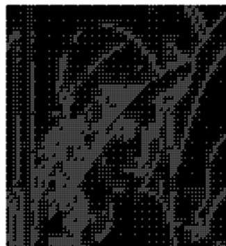
Fig. 4. Decompressed secret image.

Here the obtained spatial quality score 0.6256 lies between 0 and 1 for which the tested video is treated as a high quality video sequence.