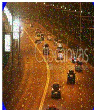
Fig .3. Test video frame.

Here the obtained spatial quality score 0.6256 lies between 0 and 1 for which the tested video is treated as a high quality video sequence.