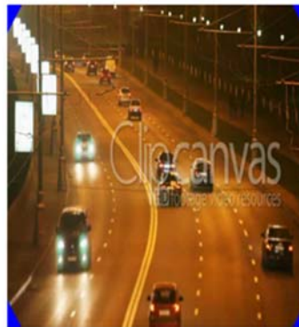
Fig. 2. Reference video frame.

The Fig.2 shows the reference video frame where the optical flow is smooth and distortions are not affected. And Fig.3 shows the test video frame affected by salt and pepper noise so that optical flow is inconsistent and hence features are affected.