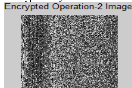
Fig. 2 (b)(ii) Output of encryption operation-2

The data hider does not allow adversaries to crack the system for embedded message. The original image is encrypted with a stream cipher using an encryption key.