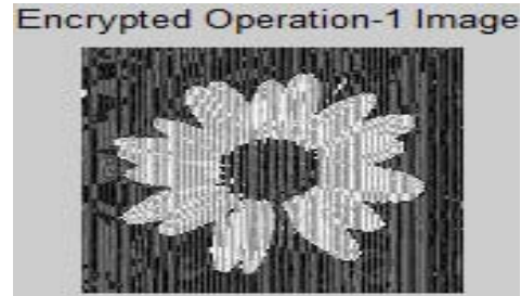
Fig. 2 (b)(i) Output of encryption operation-1

The data hider does not allow adversaries to crack the system for embedded message. The original image is encrypted with a stream cipher using an encryption key.