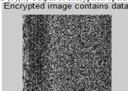
Fig. 2(c) Encrypted image contains secret data