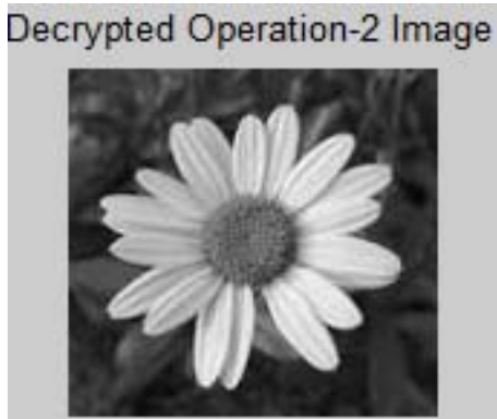
Fig. 4(b) Output of decryption-2 Fig.4 Image recovery

For the data hider, the additional bits are also protected with the embedding key. Data extraction and image reconstruction is separable in this method. The three different cases at the receiving end is hence solved here; with the encryption key only, with the embedding key only and with the two keys together.