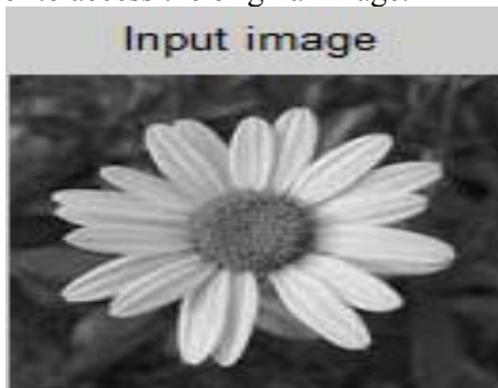
Fig. 2(a) Original image

Because no operation is performed before image encryption, the proposed method is a kind of VRAE. With the encryption key only, an approximate image can be reconstructed with high quality. The two aspects of security is considered here. Security of the image content and the security of the additional message. The content owner does not allow the service supplier to access the original image.