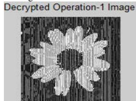
Fig. 4(a) Output of decryption-1