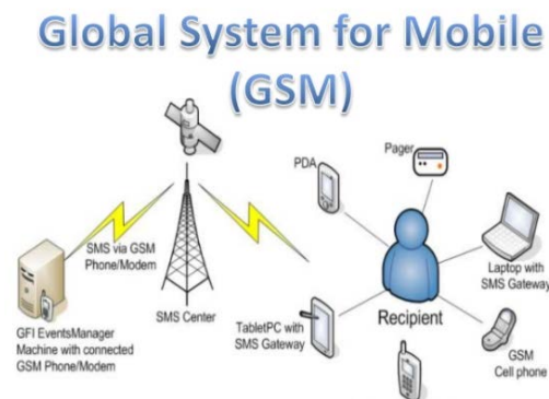
Fig.3.2. GSM communication system.

geographical region controlled by means of the MSC corresponds to that managed with the aid of the VLR, simplifying the signaling required. Note that the MSC carries no facts approximately particular cell stations - this information is saved within the location registers.