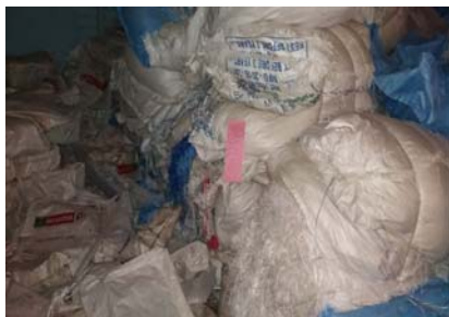
Fig. 3. Before sorting and order

In sorting, distinguished the useful and scrap items. Then scrap items were kept all aside at one location which is just located beside the entrance of the storeroom. We have separated the scrap and placed it besides the entrance and named it as a scrap yard. In this scrap yard we placed all the scrap at one time and some of the scraps are placed at different location due to shortage of space.