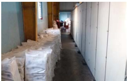
Fig. 4 After sorting and order

In sorting, distinguished the useful and scrap items. Then scrap items were kept all aside at one location which is just located beside the entrance of the storeroom. We have separated the scrap and placed it besides the entrance and named it as a scrap yard. In this scrap yard we placed all the scrap at one time and some of the scraps are placed at different location due to shortage of space.