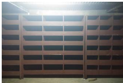
Fig.6 After set order

materials. The following fig shows the diffident arrangement of the tools and materials.