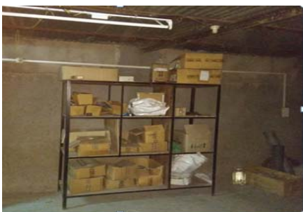
Fig. 5 Before set order

After removing scrap, we set the useful materials according to order the their respective sizes. We differentiated Baskets, bobbins and loom wheels according to the sizes, and then we set fittings into their different categories.