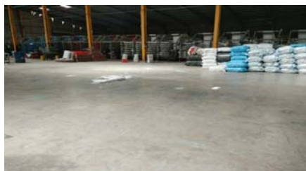
Fig. 7 Floor cleaning

Cleaning is a third method of 5S technique; we implemented this method as we were proceeding with the sorting method. As we were proceeding the sorting, we were differentiating used & not used items and then we cleaned the whole place, then after this we reached every rack & then cleaned every rack for cleaning method. For cleaning, we removed all the items from their racks and cleaned racks. While cleaning, we also fixed the air conditioner leaked pipe. In this step, we clean all places in the industry. This step has been going to the neatness and shine in the industry.