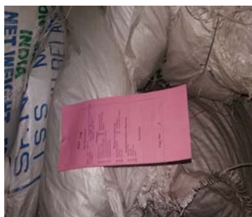
Fig.7 Red tag system

Red tag system in this we create a one format for all types of processing it contains no. of parameters which gives an idea about what will do the next of this machine or component were the red tag is attached. We introduce these red tags to the company for their use.