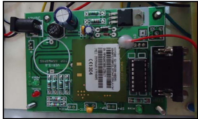
Figure 2: Experimental setup for environmental monitoring

To control and monitor the environmental variables planned in an earlier section, sensors and actuators capable of measuring and controlling the values inside the greenhouse are essential. Generally, a greenhouse control is implemented just by approximating a calculated cost to a reference or ideal cost. Figure 2 shows the basic block diagram of the proposed model. Due to cost considerations, the proposed model uses sensor network instead of wireless sensor network. The sensed data is forwarded to the gateway. The gateway then forwards the data to the remote monitoring base station. The base station is a remotely located software configured computer, where the monitored details are periodically visualized to carry out further control actions.