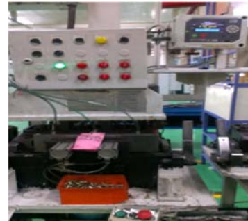
Figure 3: Valve leak Testing

This is the process of testing leakage during compression stroke of engines. During compression when the charge is getting compressed then there is a chance of leakage occurring through the valves. Thus a pressure decay leak testing procedure is used to see the amount of leakage through the valves. This machine uses dry air, which is first supplied through the intake, then all the valves are closed and the amount of air pressure that gets leaked is calculated through the exhaust. If the leakage is more than the permissible limits, cylinder head fails the test. There is a light corresponding to each valve which is turned on if leakage occurs through that valve.