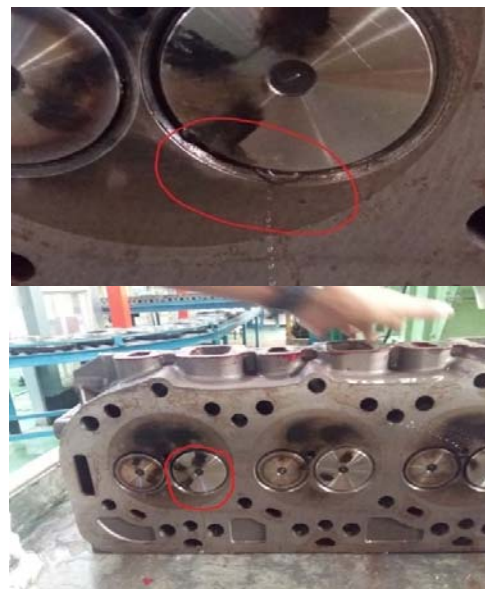
Figure 2: water leaking at the valve cylinder interface

Compression Leakage in cylinder heads is one of the major problems being faced by the industry as it does have a considerable effect on the efficiency of the engine and the engine is not able to produce sufficient horsepower (HP). Broadly speaking, the piston moves from BDC to TDC compressing the cylinder air to certain pressure for combustion to occur. The resale of pressure at the cylinder head (due to leakage at valve seat) makes it impossible for the cylinder to attain the presided pressure for combustion this is known as Head compression Leakage (HCL). Head compression Leakage is of the major reason behind lowering of the engine efficiency.