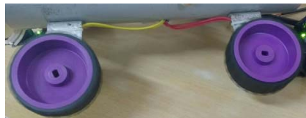
FIG. 1 Design of the robot wheels

The propeller is powered by a high voltage battery which runs a motor attached to the shaft. The motor is held in place by clamps and screws.