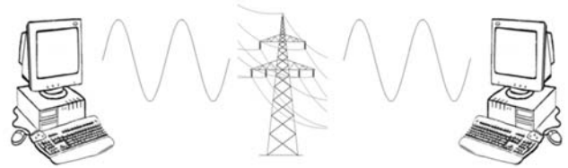
Figure 1 Powerline communication system.

In PLC, powerline is transformed into a channel through the superposition of a low energy information signal to the power wave. Figure 1 shows the powerline communication system. It shows the basic structure of PLC model.