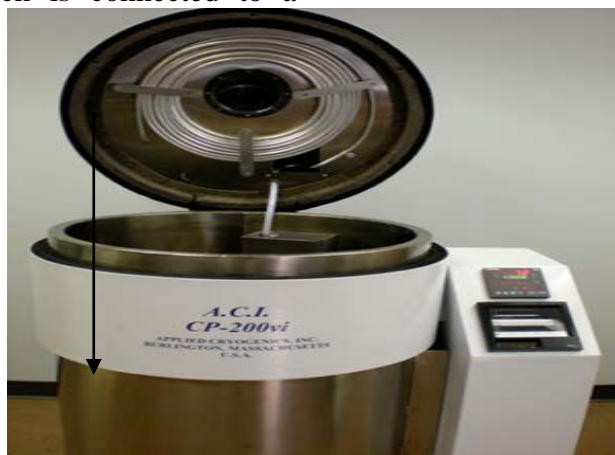
Figure 1. Photographic View of Cryo Chamber

liquid nitrogen tank through a vacuum insulated hose. The temperature sensors inside the chamber sense the temperature and accordingly the PID temperature controller operates the solenoid valve to regulate the liquid nitrogen flow. The liquid nitrogen passes through the spiral heat exchanger and enters the duct leading to the bottom of the chamber as nitrogen gas. The blower at the top of the chamber sucks the gas coming out at the bottom and makes it circulate effectively inside the chamber and reduces the chamber temperature. The programmable temperature controller of the cryogenic processor is used to set the deep cryogenic treatment parameters, which in turn, control the process parameters like soaking time, temperature and cooling rate. Through the data acquisition system, the deep cryogenic treatment processes are recorded and stored. Figure 1 shows photographic view of Cryo-Chamber