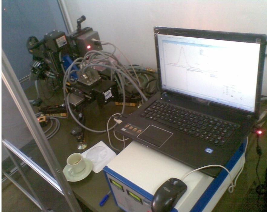
Figure 2.1. Photographic View of X-Ray Diffractometer

of PROTO software. The residual stress was calculated as to given two input parameters namely Bragg angle and \frac{1}{2}S_2 , based on the ASTM standard and directly giving the input parameter to the XRD. Figure 2.1 show the photographic view of XRD. The test facility is available in CMTI, Bangalore.