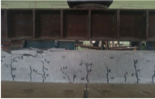
Figure 6.7 Crack Pattern