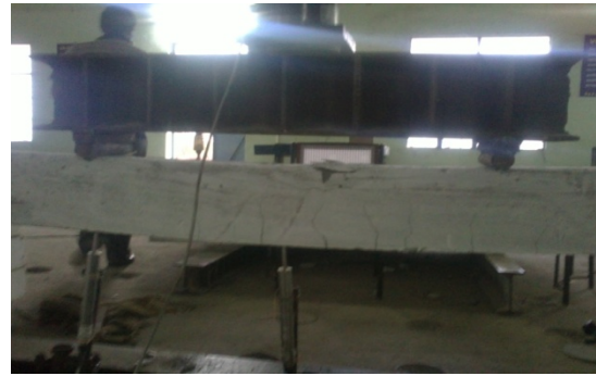
Figure 6.5 Shear Failure of Tested Beam

The nominal shear is less than designed shear strength of concrete beam, the minimum shear reinforcement shall be provided. The nominal shear is exceeds designed shear strength of concrete beam, the shear reinforcement shall be provided. The effect of shear stress is greatest in web of the beam and is maximum at the neutral axis and decrease to zero at the extreme edges. Shear forces tend to cause diagonal cracks radiating from the top and at 45^\circ to the plane of the beam. These are steeper where bending moment prevail and are more inclined where the shear are largest. In this experimental work the specimens are behaving like same manner in the shear failure mode. Cracks due to shear are widest in the region of the neutral axis and become thinner towards the upper and the lower of the beam.