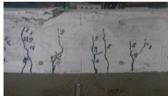
Figure 6.6 Strain Measuring Points