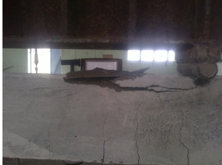
Figure 6.8 Crushing at mid span