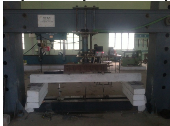
Figure 5.13 Testing of Beam Specimen

The experimental setup is shown in Figure 5.13. All beams were tested in reaction type loading frame of capacity 500 KN. The span of the beams kept as 2000 mm with simply supported end condition and was tested under two point loading applied at one third span points through a stiff beam. Deflections of the beams were measured by three LVDTs at midspan, one third span and one fourth span.