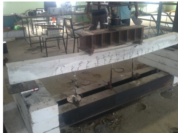
Figure 4.1 Flexural failure of the tested Beam