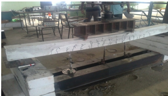
Figure 6.4 Flexural failure of the tested Beam

In the under reinforced section beam, the member approaches failure due to gradual reduction of compression zone, exhibiting and cracks, which develop at the soffit and progress towards the compression face. When the area of concrete in compression zone is insufficient to resist the resultant compressive force, ultimate flexural failure of the member takes place through the crushing of concrete. Large deflection and wide cracks are the characteristics futures of the under reinforced section at failure. This type of behaviour is generally desirable since there is considerable warning before the impending failure. Generally over reinforced member failed sudden crushing of concrete, the failure being characterized by small deflection and narrow cracks. Cracks due to bending moment are widest at the bottom and narrower at the top compression side.