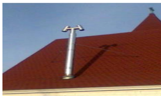
A H-style cowl:

A chimney cowl or wind directional cap is a helmet-shaped chimney cap that rotates to align with the wind and prevent a backdraft of smoke and wind back down the chimney.