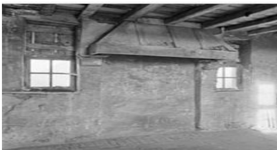
A smoke hood in the Netherlands.