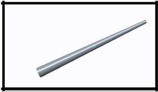
2D MODEL OF CHIMNEY