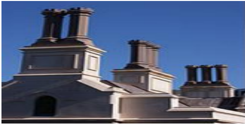
Chimneys on the Parliamentary Library in Wellington, New Zealand.

A characteristic problem of chimneys is they develop deposits of creosote on the walls of the structure when used with wood as a fuel. Deposits of this substance can interfere with the airflow and more importantly, they are combustible and can cause dangerous chimney fires if the deposits ignite in the chimney. Heaters that burn natural gas drastically reduce the amount of creosote buildup due to natural gas burning much cleaner and more efficiently than traditional solid fuels. While in most cases there is no need to clean a gas chimney on an annual basis that does not mean that other parts of the chimney cannot fall into disrepair. It is now possible to buy "faux-brick" facades to cover these modern chimney structures. Other potential problems include: "spalling" brick, in which moisture seeps into the brick and then freezes, cracking and flaking the brick and loosening mortar seals. Shifting foundations, which may degrade integrity of chimney masonry nesting or infestation by unwanted animals such as squirrels, or chimney swifts chimney leaks drafting issues, which may allow smoke inside building issues with fireplace or heating appliance may cause unwanted degradation or hazards to chimney