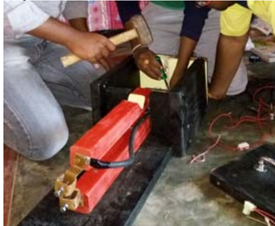
Fig.9. Assembling of parts

Now plug the machine to the power supply and check whether the machine is working or not . If not check all the connections . If the machine is working the work is done and we have to do the analysis .