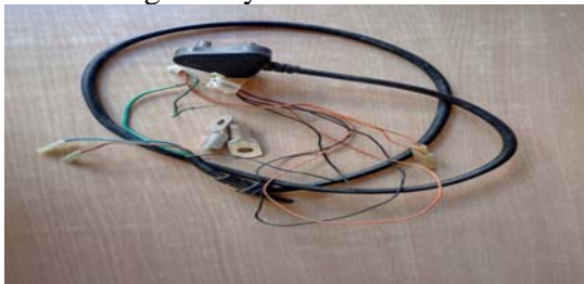
FIG.7. Legs and Cables