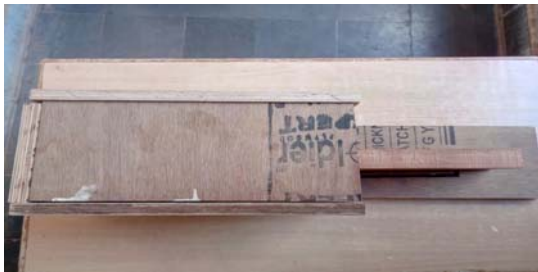
Fig.6. Play wood for Cabin

We take mango wood for cabin and apple wood for electrodes holders . First, we take 30x1½ inches for long and heavy base later we allotted 10 inches for the cabin 17 inches for the purpose of electrodes and remaining 3 inches for the purpose of safety because while welding the sparks will occur . We took the square cross-section electrodes 2x2 inches and 17 inches long . We fixed the down electrode and upper is movable for that movement we have given V-groove . we took the square cabin of height 10 inches and we attached a safety switch at back this is the construction of cabin and base .