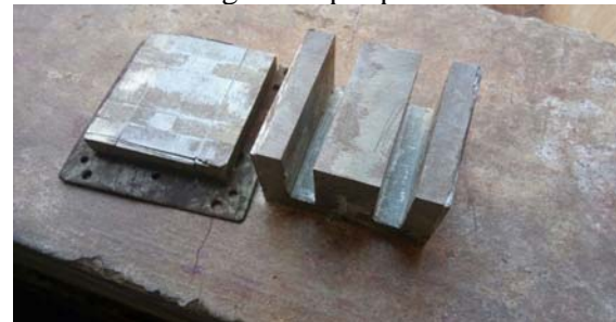
Fig.3. Core without Winding