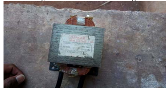
Fig.4. Step-Down Transformer