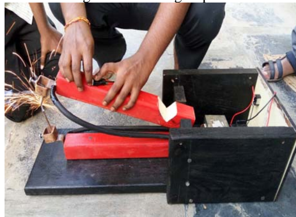
Fig.10. Final view of Spot welding machine