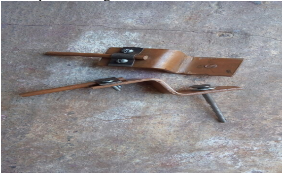
Fig.5. Metal Melter lugs

Our metal melter shows the value as 1.6V . By this, we achieved the desired output voltage and also we come to know that a high current of 650amps is produced .it is enough to melt the metal . Now we have to make this metal melter into a spot welding machine .