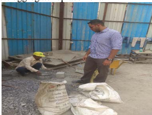
Fig no: 1 Sieving of recycled aggregate

The concrete mix were prepared by replacing coarse aggregate with recycled concrete coarse aggregate and adding fly ash as partial replacement for cement. The concrete mix design for M-30 is done as per IS 10262:2009. Four trial mix with recycled concrete aggregates and fly ash were prepared. The replacement percentages were 40%,50%,60% and 80% by weight of coarse aggregate in the concrete mix. The trial mix were designated as TM2 with 40% recycled concrete aggregate replacement, TM3 with 50% recycled concrete aggregate replacement, TM4 with 60% recycled concrete aggregate replacement, TM5 with 80% recycled concrete aggregate replacement.