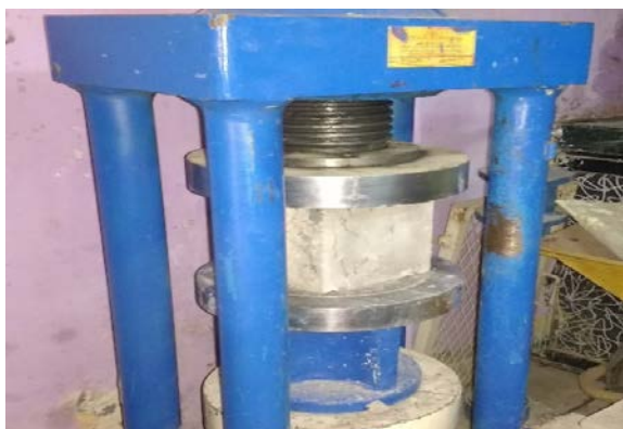
Fig no: 2 Cubes tested on Compressive testing machine