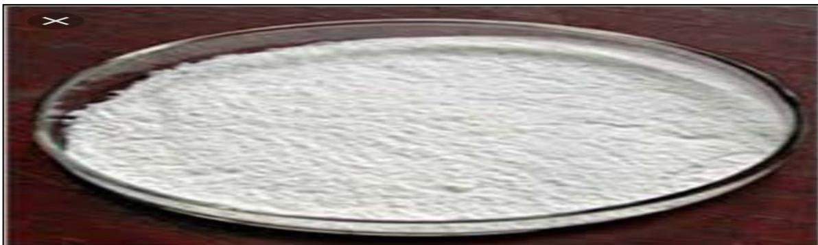
IndiaMART Bleaching Powder at Rs 16 /kilogram(s) | Bleaching Powder | ID

small packets. Their chlorine content not decrease with storage. They can be applied in dry condition or as in liquid condition.