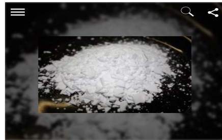
Stearyl Alcohol (Ginol 18)