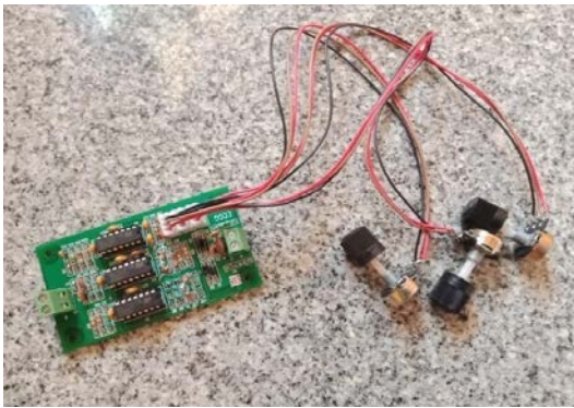
Figure IV-1 Hardware Circuit Prototype